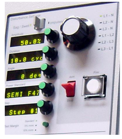
The IPC is designed for optimum ease of use and user safety.